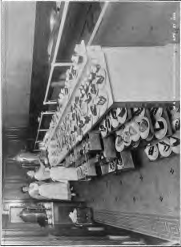
The New Allegheny High School lunchroom in Pittsburgh, opened fall of 1915. Counters were especially designed for display and quick service, and so constructed that they are easy to keep in sanitary condition